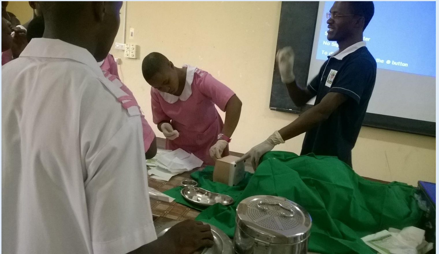
Modern and sufficient practical demonstration equipment's