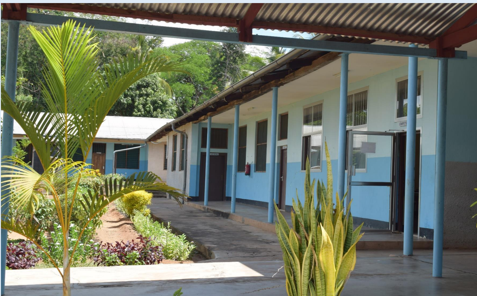
School surrounding environments