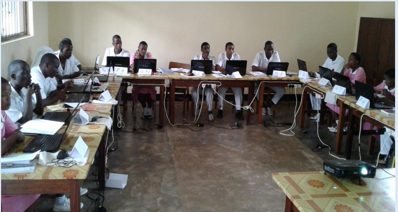
Modern computer laboratory equipped with laptops with Wi-Fi networks